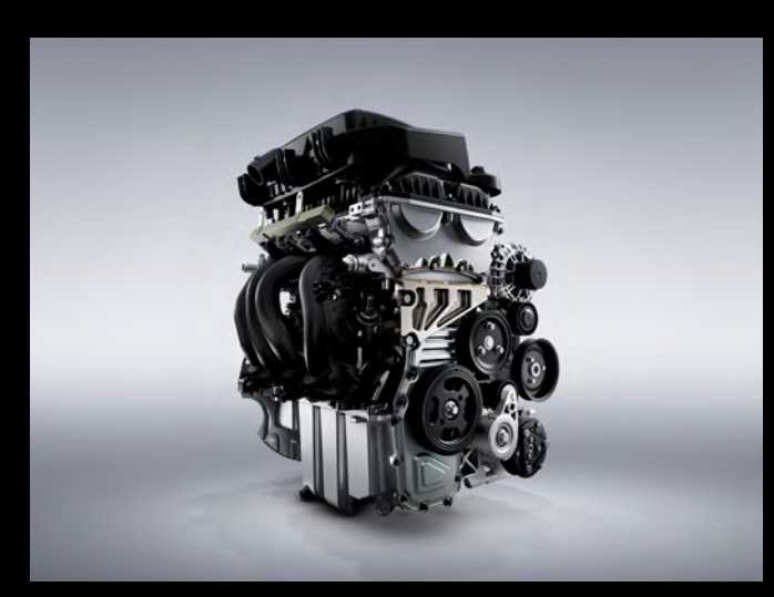
84kW 1.5L NSE Major